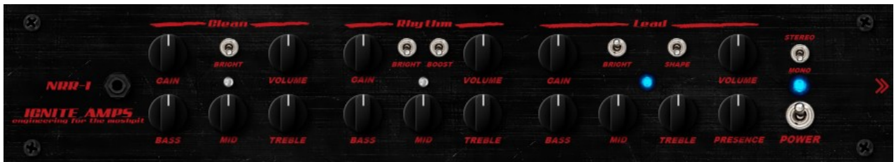
Fig. 2 – NRR-1 Front Panel