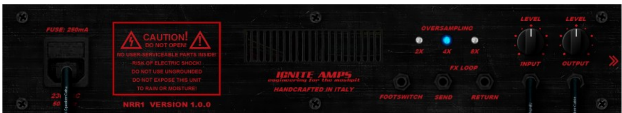
Fig. 3 – NRR-1 Back Panel

As you can see from the screenshots ( fig.2 and fig.3 ), we've decided to make NRR-1 as similar as possible to the real hardware, in order to make the user experience easier, giving the chance to tweak the controls of the plug-in like one would do when having the real rack preamplifier in front of him.